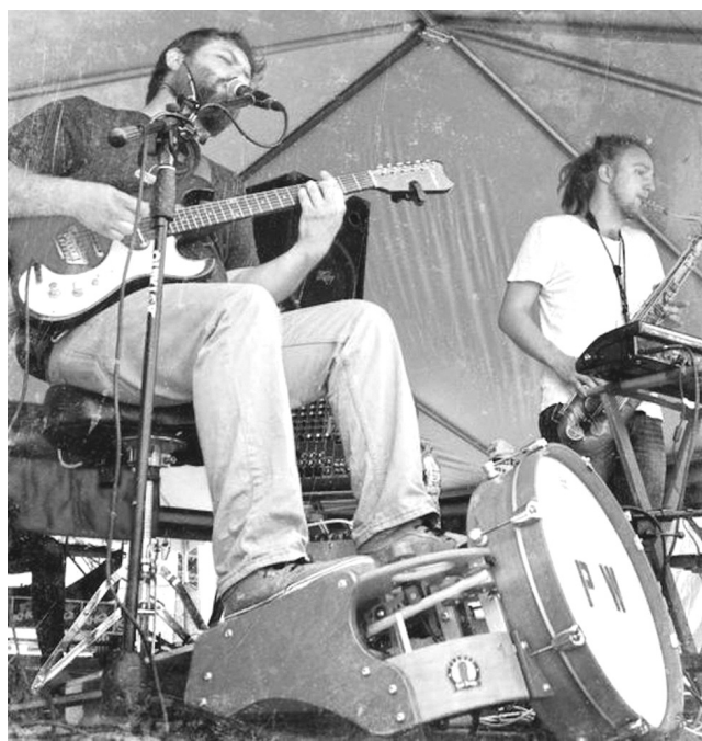
The Pistil Whips, a local duo band out of Boyne City will be on stage Friday, July 20, 7pm in the East Jordan Memorial Park Bandshell.