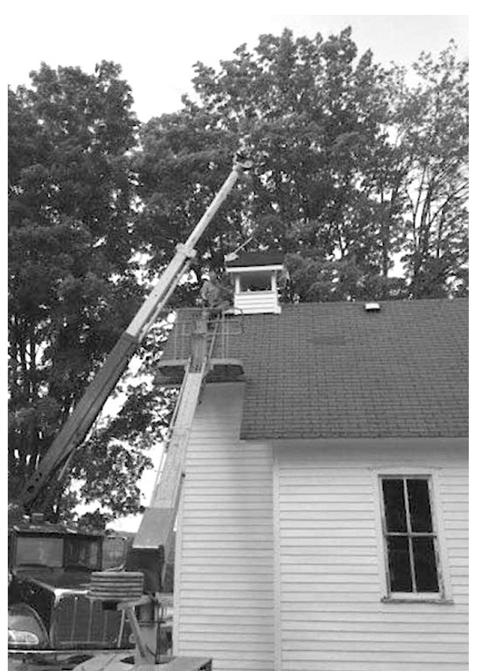
A special dedication event will be held from 5 to 8pm on Wednesday, July 25, at the Huddleston School on the Northern Michigan Antique-Flywheelers (NMAF) club showgrounds.

Located on US 131 between Boyne Falls and Walloon Lake, the club hosts the annual event where several hundred volunteer members and helpers show visitors a glimpse of life in