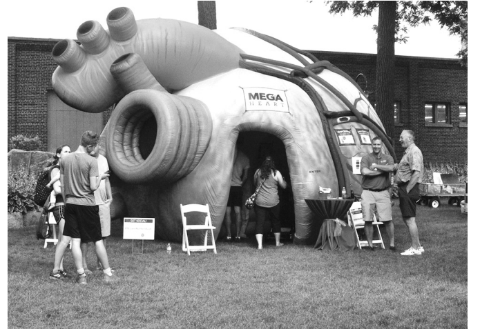
Those attending the McLaren Northern Michigan Community fundraiser event in downtown Petoskey's Pennsylvania Park last week were able to tour the "MegaHeart" which gives an up close and inside view of the human heart.

McLaren kicked off its public capital fundraising phase last week with a health fair in downtown Petoskey's Pennsylvania Park. For more information about the expansion project or to contribute, go to: mclarennorthernbuilds.org