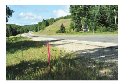
Neon pink markers like this one line the five-mile-long stretch of M-75 between Walloon Lake and Boyne City where the road will be resurfaced starting this week and finishing up in late August.