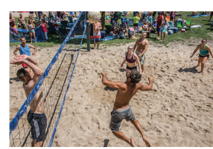
Activities and games at the Venetian Festival will include disc golf, volleyball, a horseshoe tournament and more.