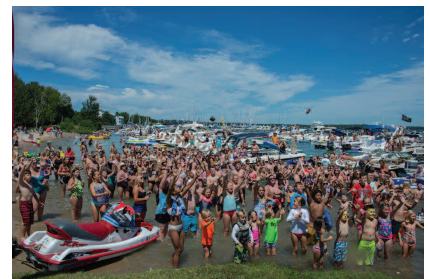
It's the "big town festival with the small-town appeal," and from Saturday, July 21, through the following Saturday, the 88th Annual Venetian Festival will once again bring an amazing amount of music, athletic competitions, games, beach parties, food, fun and of course, a boat parade and fireworks, to Charlevoix.

Of course, the lighted boat parade remains an anchor event of the Venetian Festival, taking place this year on July 28 at dusk on Round Lake, featuring a "Gods of the Sea"