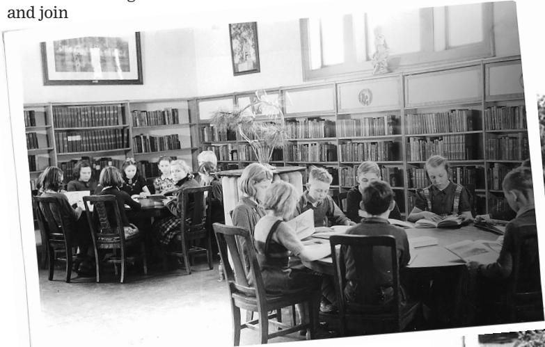
ABOVE: Shhh! Students from a bygone era study at the Boyne District Library.